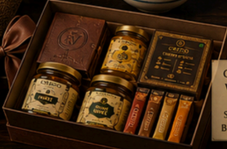
CURATED GIFTS WITH PURPOSE Artisan Crafted Sustainably Sourced Beautifully Presented