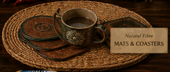
Natural Fibre MATS & COASTERS