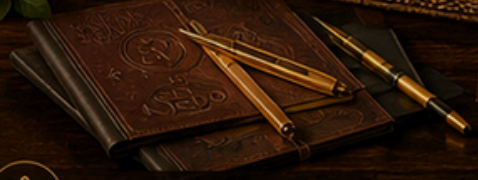
Thoughtfully Crafted JOURNALS & STATIONERY