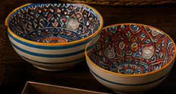
Handcrafted CERAMICS COLLECTION